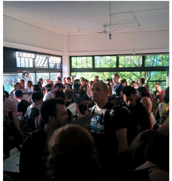
Opening of "Ink & Drink"