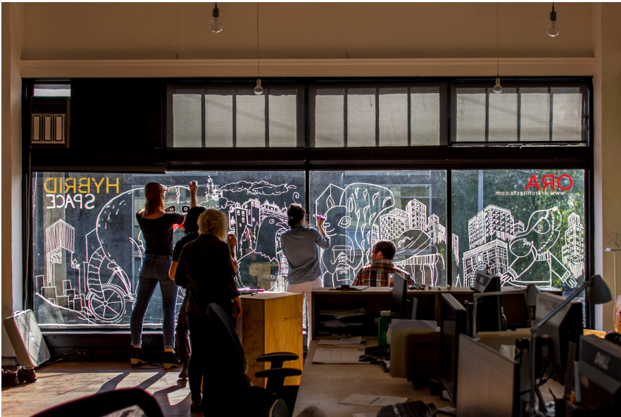
Opening of "Window Monsters"