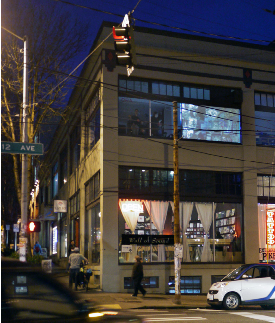
Video Projection of "Steal Away"